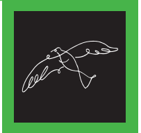
Let the osprey guide your way

Experience the Northern Beaches — 5.7 km one way, approximately 2–3 hours